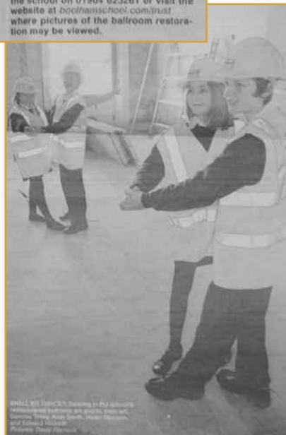
SMALL BUT SPACIOUS: Drawings in the adjacent information board are, from left, plans of the ballroom, the school, and the school's new display boards.

Other enquirers are welcome to phone the school on 01904 623261 or visit the website at boothamschool.com/trust where pictures of the ballroom restoration may be viewed.